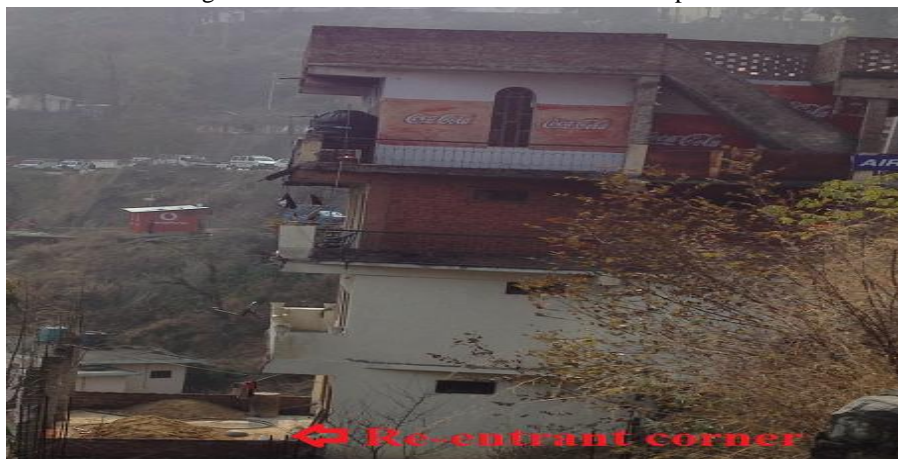
Fig7: Re-entrant corner

According to IS 1893 (PART 1) 2002, building with setbacks causes two types of problem that is immediate jump in earthquake forces at the phase of irregularity and torsion. Fig. 7 shows that only the half portion of the base of the building has been utilized which results in the collapse of structure.