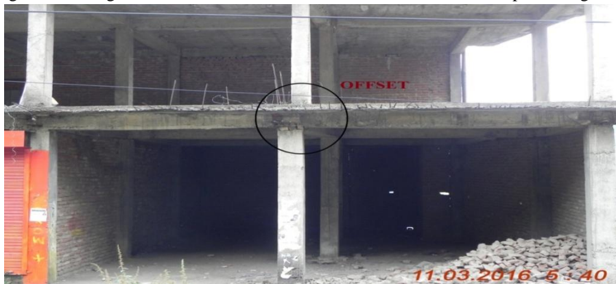
Fig 6: Offset in layout of columns

Offset is basically defined as the alignment defects in the column of the structure. The structure shown in the figure 6 is located in Solan district and is under construction. The building has three storeys and is constructed with brick infill panels. Figure shows that the column that is under construction has shown offset in them. The result of misalignment during construction between the two columns results in collapse during an earthquake.