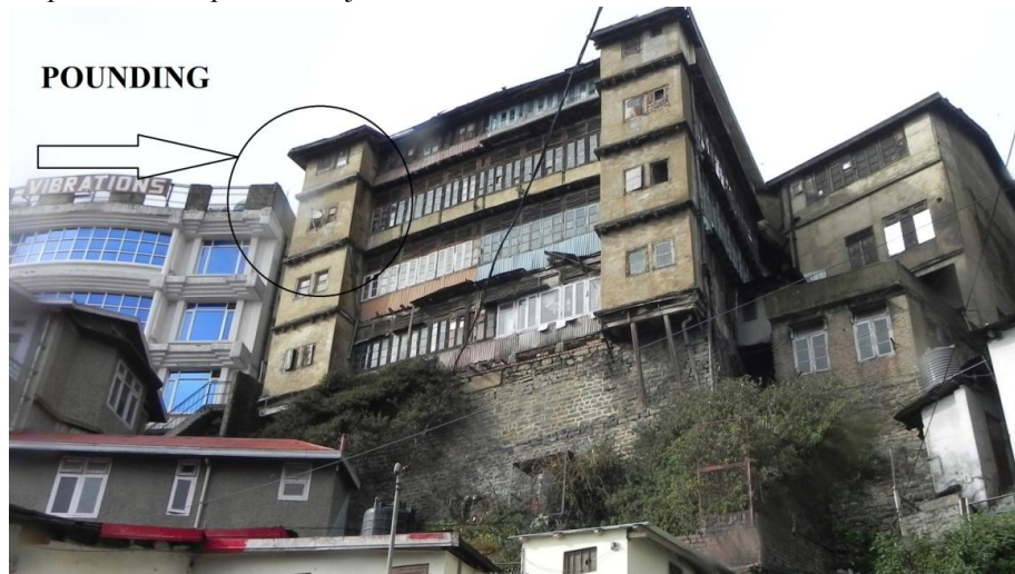
Fig 1: Pounding defect

U_a, U_b = Peak displacement response of adjacent structures 'a' and 'b'.