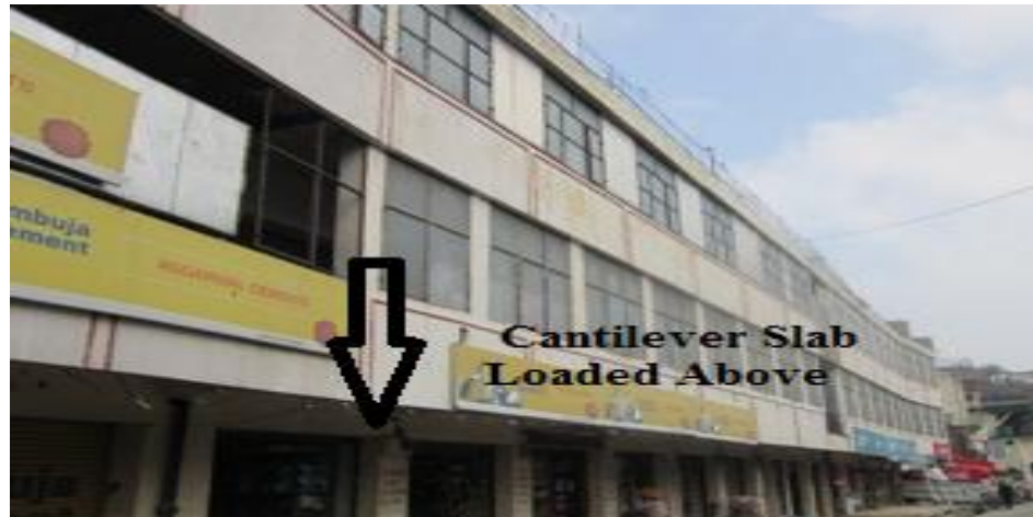
Fig 8: Structural defect due to cantilever slab loaded above

This is the portion in the building that has been used as a free space like balconies with low load capacity. Fig. 8 show the commercial building located in market of Solan district. The extra weight that has been loaded above will result in collapse during an earthquake. In order to rectify this column has been provided below the slab, so that the above load will be distributed on it.