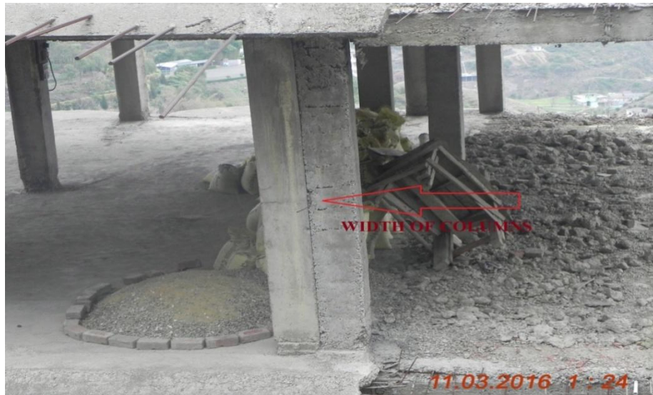
Fig 3: Structural defects due to improper width of columns