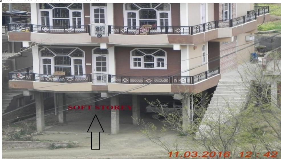
Fig 2: Soft Storey Building

A soft story building is also called as a multi-story building which have one or more floors that includes windows, wide doors, unobstructed commercial space and openings where a shear wall be required to provide stability in earthquake engineering design. [12] fig. 2 shows that a soft story has level less than 70% or 80% from the average stiffness of above three floors.