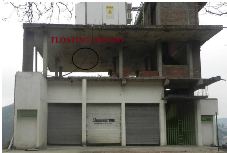
Fig 4: floating columns

Floating column is considered as that column which is hanging on the structure and transferring its load to the ground level or the column is provided on the ground level but on the first floor no column is there and above that weight is there which result into collapse of the structure. It rest on abeam which is a horizontal member. Fig. 4 shows that the main drawbacks of this column are that it totally divert its load to below level where no column is provided that result into collapse of the structure. The column is hanging in the middle of the story which leads to the failure of the building due to shear and overturning. Floating columns has not been covered in any IS code.